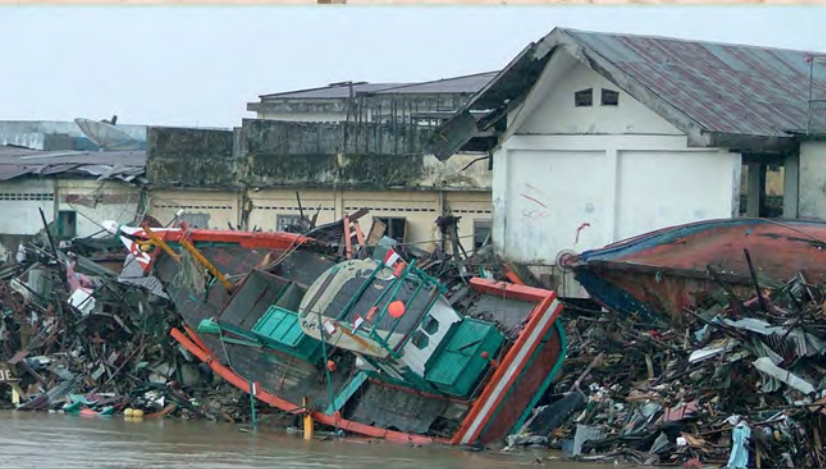
Aftermath of the 2004 Indian Ocean Tsunami