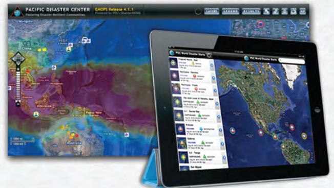
PDC's decision support platform provides real-time multi-hazard monitoring and warning, and presents global hazards data in web-accessible maps and information products.

Our capacity building efforts around the world help ensure that communities have the tools and knowledge required to reduce disaster risk. In 2009-10, the PDC team created customized course materials and trained more than 100 of Vietnam's national and provincial disaster management professionals as part of the World Bank-funded Natural Disaster Risk Management Project.